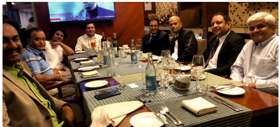
Interaction with Indian Business Forum, at Addis Ababa