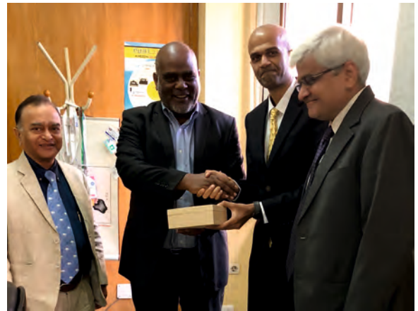
Meeting with Investment Commissioner, Federal Democratic Republic of Ethiopia