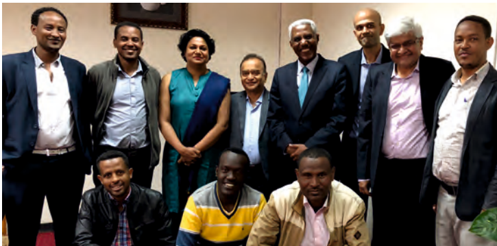
India ITME Society Delegation with ETIDI Team, Addis Ababa