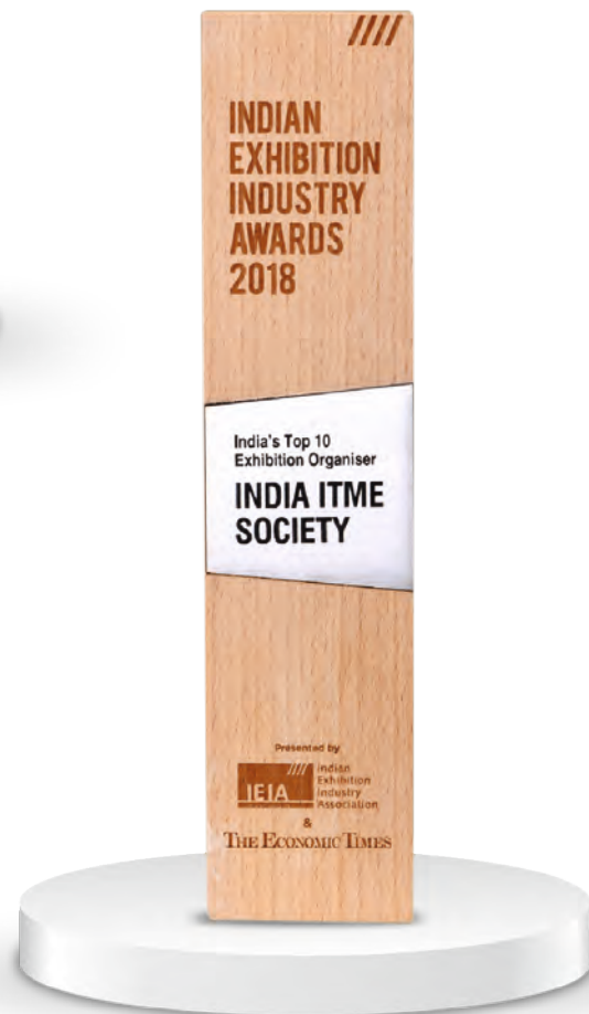
India's Top 10 Exhibition Organiser 2018

India ITME Society was conferred jointly by The Economic Times & IEIA Open Seminar as India's Top 10 Exhibition Organisers & INDIA ITME Exhibitions ranked as India's 1st runner up in Top B2B Exhibition, at Award function held at HITEX Exhibition centre, on 10 th May 2018.