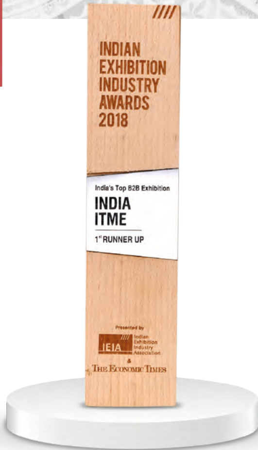
India's Top B2B Exhibition 2018