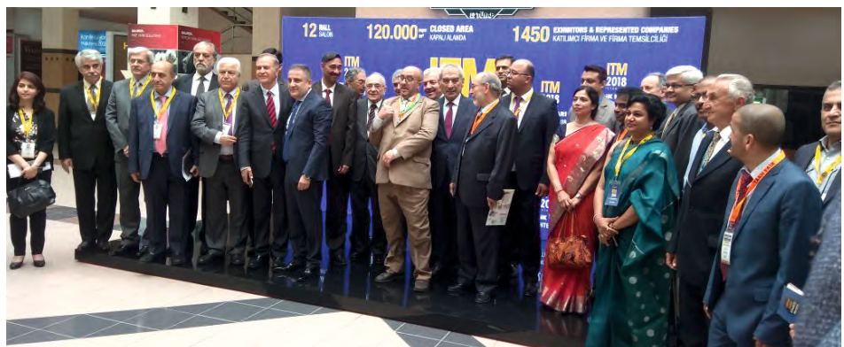
ITM - 2018 Turkey, Istanbul Turkey : 14 - 17th April 2018