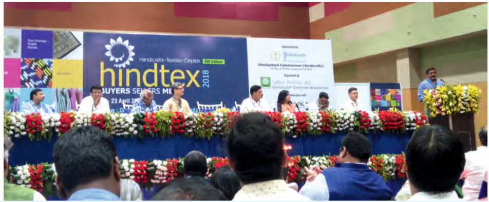
Hindtex 2018, Varanasi : 21st April 2018