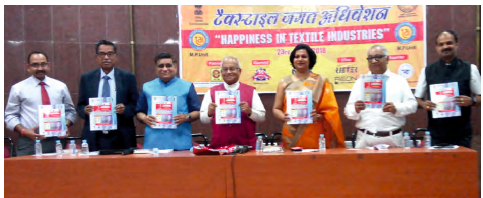
Textile Jagat Adhiveshan, Madhya Pradesh : 23rd June 2018