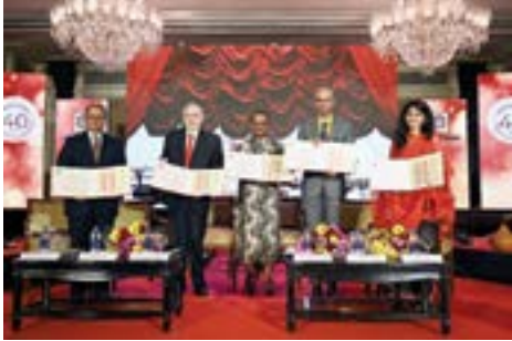
Unveiling of India ITME Society's signature Stamp