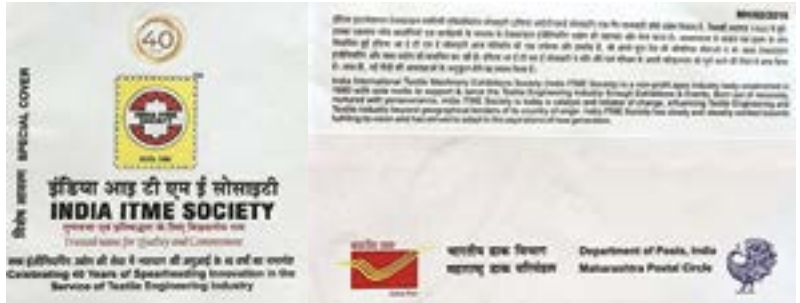
India ITME Society Special Cover