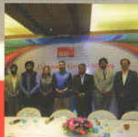
New Executive Committee- IEIA